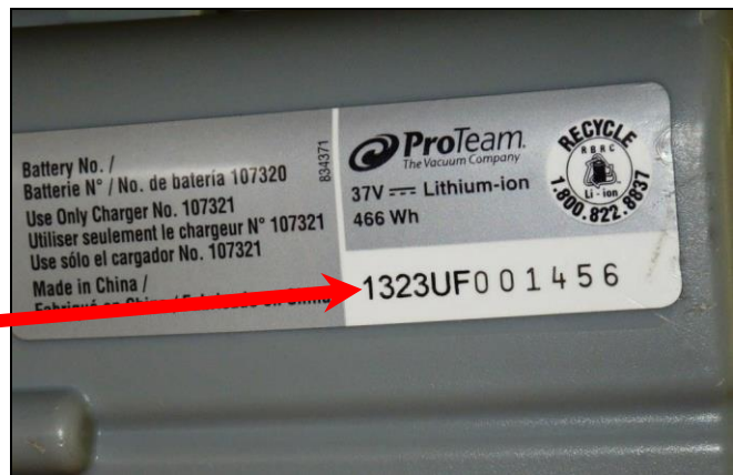
Figure 2. Serial Number is printed in the white portion of the label.

NEXT STEPS: ProTeam has identified the possibility of manufacturing anomalies in the production of its GoFree batteries. Under certain circumstances, such as recharging the batteries, these anomalies can lead to overheating of the batteries and may also present the possibility of fire.