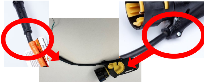
Figure 2 Locations of wear, such as gray discoloration or exposed internal conductors

Issue: ProTeam recently received reports that some users of GoFit 3, GoFit 6, GoFit 6 PLUS, and GoFit 10 commercial backpack vacuum are not properly fastening the waist belt of the body harness and/or not wearing both shoulder straps of the harness, as required, which can cause stress on the switch box power cord and, after several months of use, can cause damage to the internal conductors (Figure 2), potentially resulting in the risk of overheating the switch box power cord and possible injury.