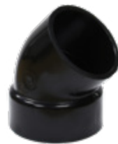
45° Drain Spout part # H226