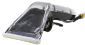
Air Lite™ Upholstery Tool part # 8400P