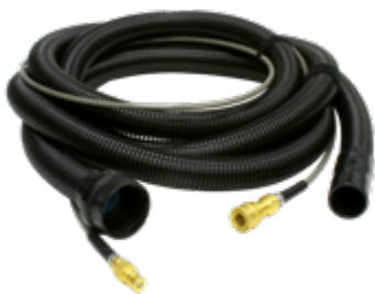
15' Vacuum and Solution Hose Combo part # 8501