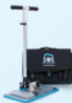
SOS PRO Sub Surface Extraction Tool by StainOut System