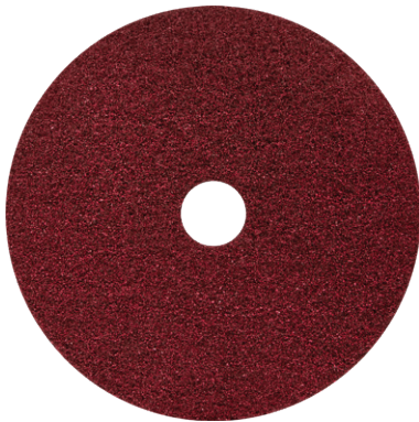
BLACK DIAMOND 400 Red Heavy-Duty Cleaning Pad

The Black Diamond Cleaning and Polishing System restores, cleans, and polishes concrete, natural stone, and a wide variety of other floor types. A range of grit levels in this four-pad system allows for a customizable floor care process based on the starting condition of the floor and the desired gloss level. Through its Integrated Matrix Technology™, microscopic diamonds embedded in the base web deliver mechanical cleaning action without the need for harmful chemical agents, achieving a clean, high gloss floor.