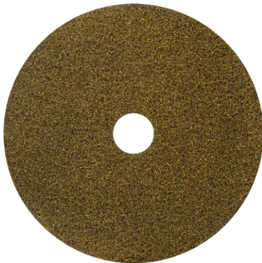
BLACK DIAMOND 1500 Yellow Initial Polishing Pad