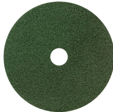
BLACK DIAMOND 3000 Green Polishing and Daily Maintenance Pad