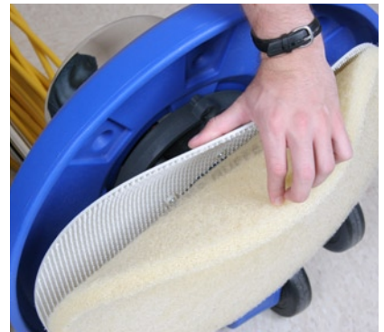
Flexible pad driver with full face pad grip contours to uneven floors.