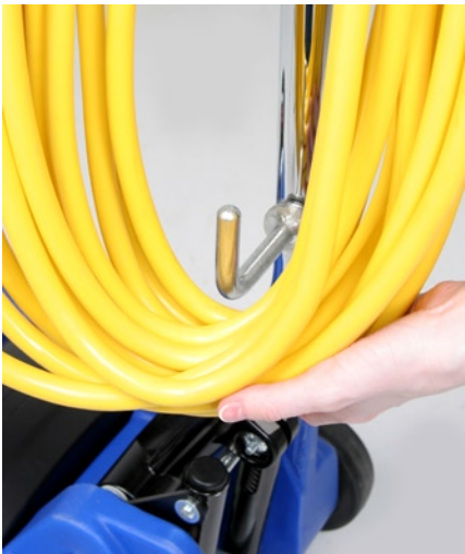
A quick release cord wrap assists the removal of the power cable without unwrapping.