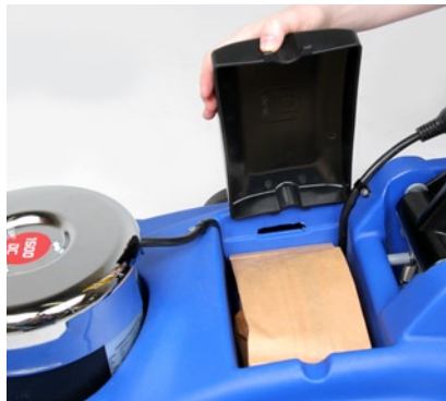
Passive dust control eliminates airborne dust and collects it in a convenient filter bag.