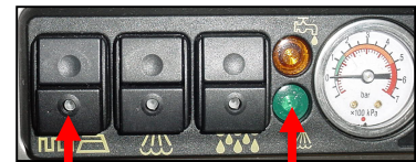
Power Steam Ready