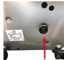
Black Drain Cap (figure 1)