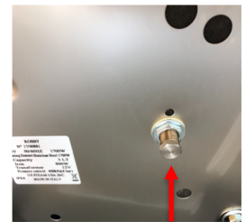
Remove Drain Plug (figure 2)