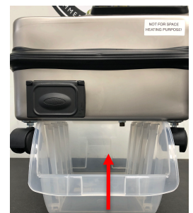
Use Catch Container (figure 3)