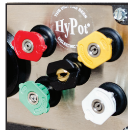
4 SPRAY NOZZLES